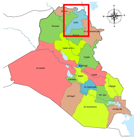
Figure 2. Map of Iraq indicating Erbil Governorate.