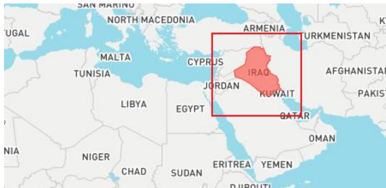
Figure 1. Map of Iraq.