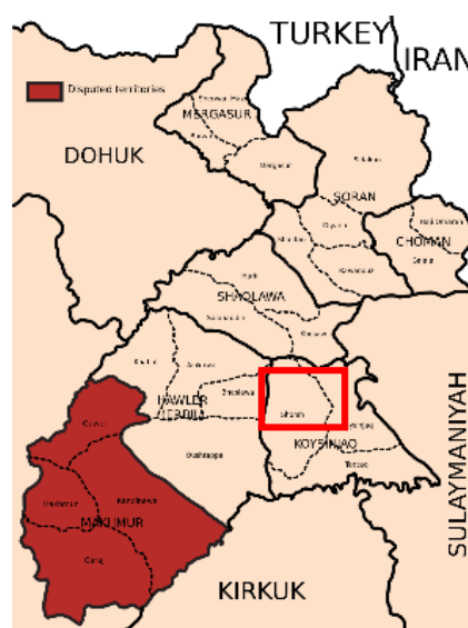
Figure 3. Map of Erbil Governorate indicating study area.